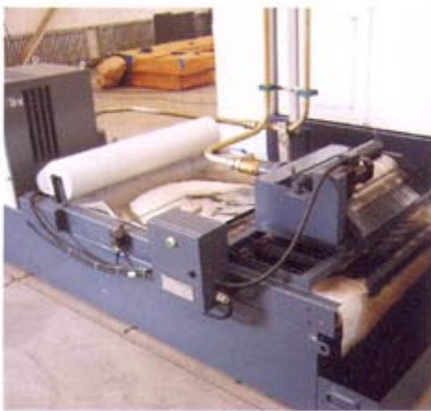
冷却系统 Cooling system